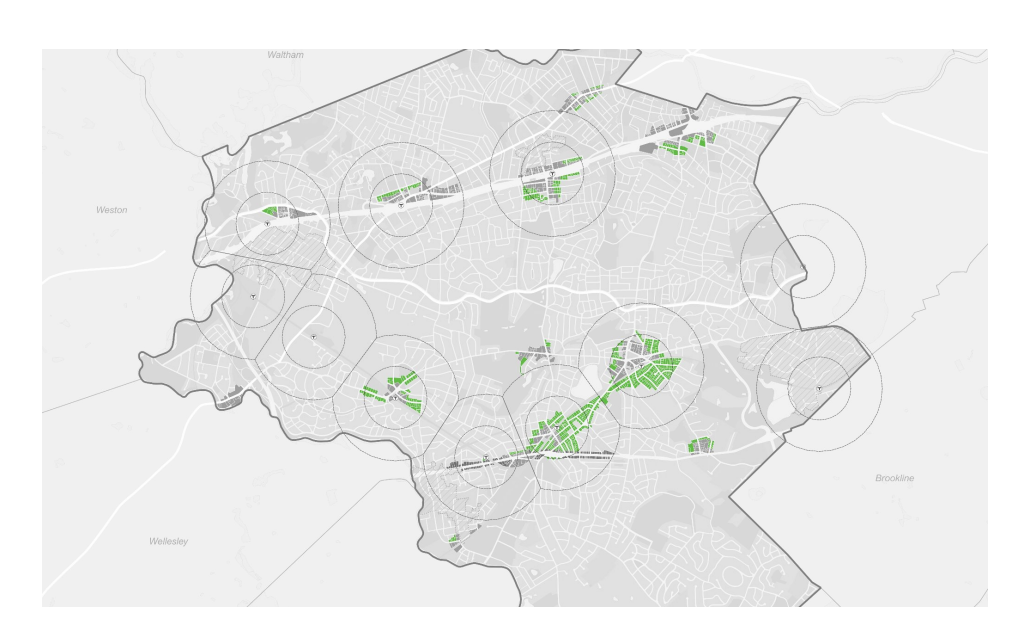
+ Formerly called VC1