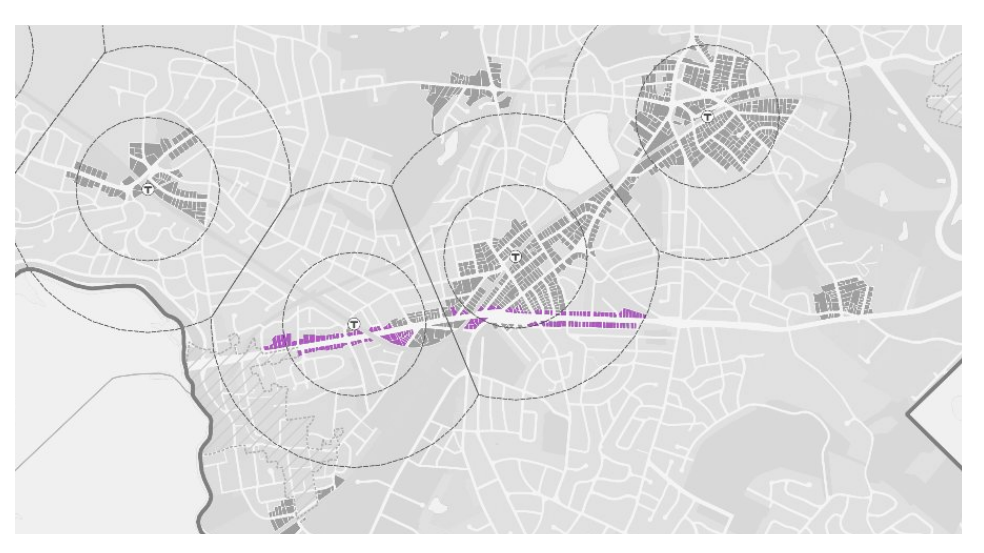
+ Zone mapped only along Route 9