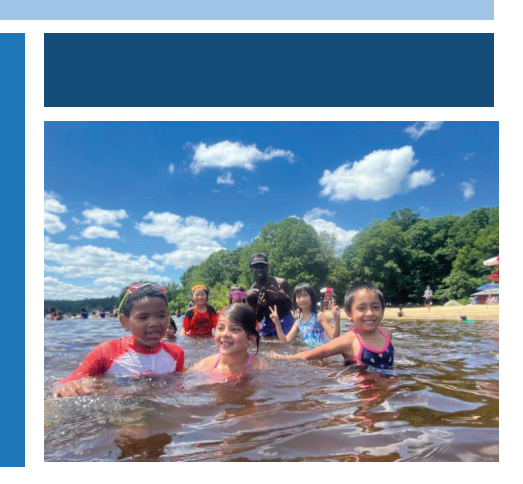
The City of Newton & WestMetro HOME Consortium