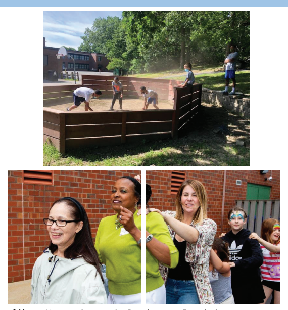
Financial support for programs that directly provide stability across the lifespan for Newton's low- to moderate-income population.

*Above: Newton Community Development Foundation