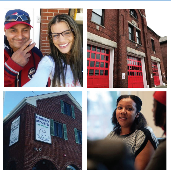
*Above (clockwise): Middlesex Human Service Agency, Brookline Community Mental Health Center, and Community Day Center of Waltham.

Provide supportive services for individuals and families that are homeless or at-risk of homelessness, including financial support for existing emergency and transitional housing.