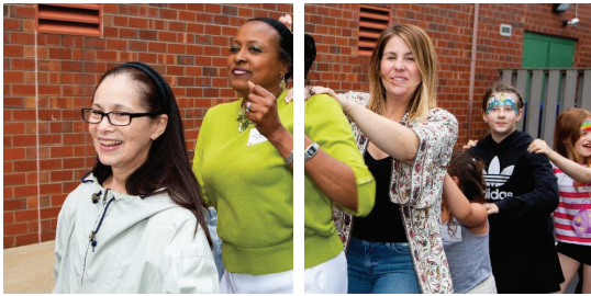
*Above: Newton Community Development Foundation

Financial support for programs that directly provide stability across the lifespan for Newton’s low- to moderate-income population.