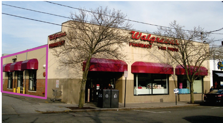
Use located at least 16 feet from the street-facing facade

Prohibit in Business 1 and Business 2 districts or allow subject to design standards?