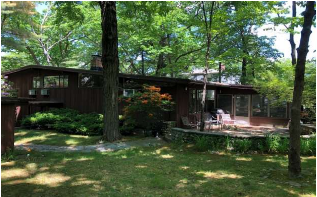
176 Highland Avenue (Compton & Pierce)

City-wide surveys have been conducted for many years in Newton but largely focused on pre-war architecture. A Mid-Century Modern survey conducted in Newton in the 1980s and 1990s missed several properties that have since come before the NHC for demolition review and were preferably preserved. This makes sense, because when these surveys were conducted, many of the buildings the NHC is now reviewing for significance were only 20 years old at the time. Recent examples of post-war historically significant buildings that were preferably preserved by the NHC include designs by Stanley Myers, Compton & Pierce, Samuel Glaser, and other mid-century architects who only recently became noted for their architectural contributions in New England. Recognition of this architectural period has reached the national level.